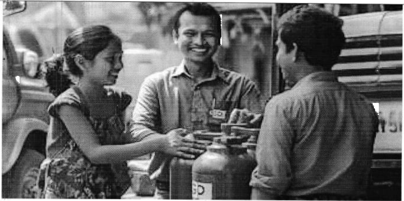
Safety First: Empowering Communities with Lifesaving LPG and Emergency Skills