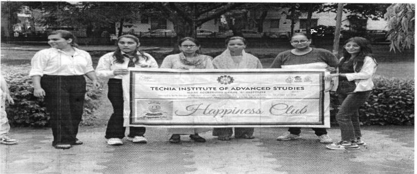
Safety First: Empowering Communities with Lifesaving LPG and Emergency Skills

Report: Description in (min 250 to max 800 words)*