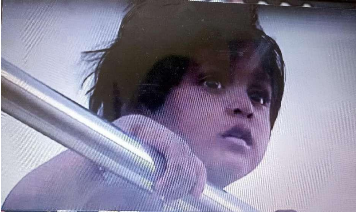
A scene from the movie showing "How the girl child is not safe".