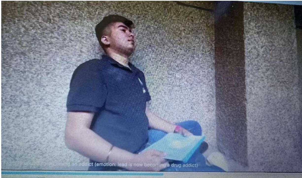
A scene from the movie showing “How students are engaging in wrong practices”.