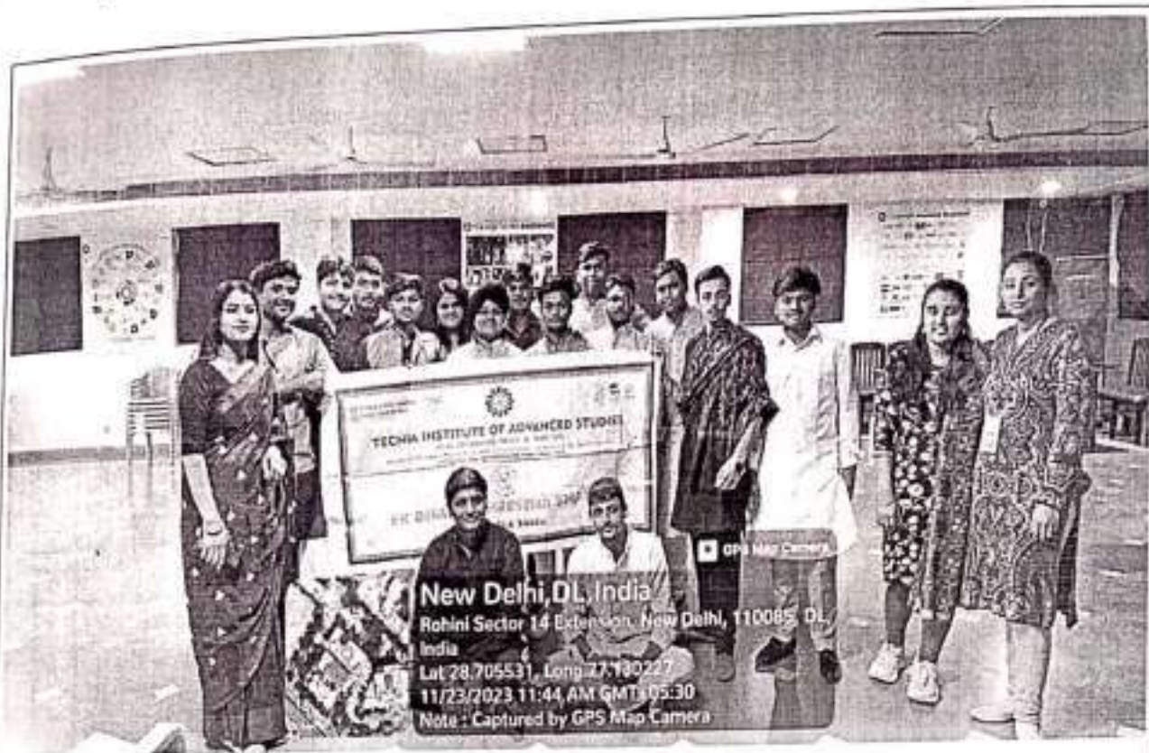
Nodal officer taking picture with participants