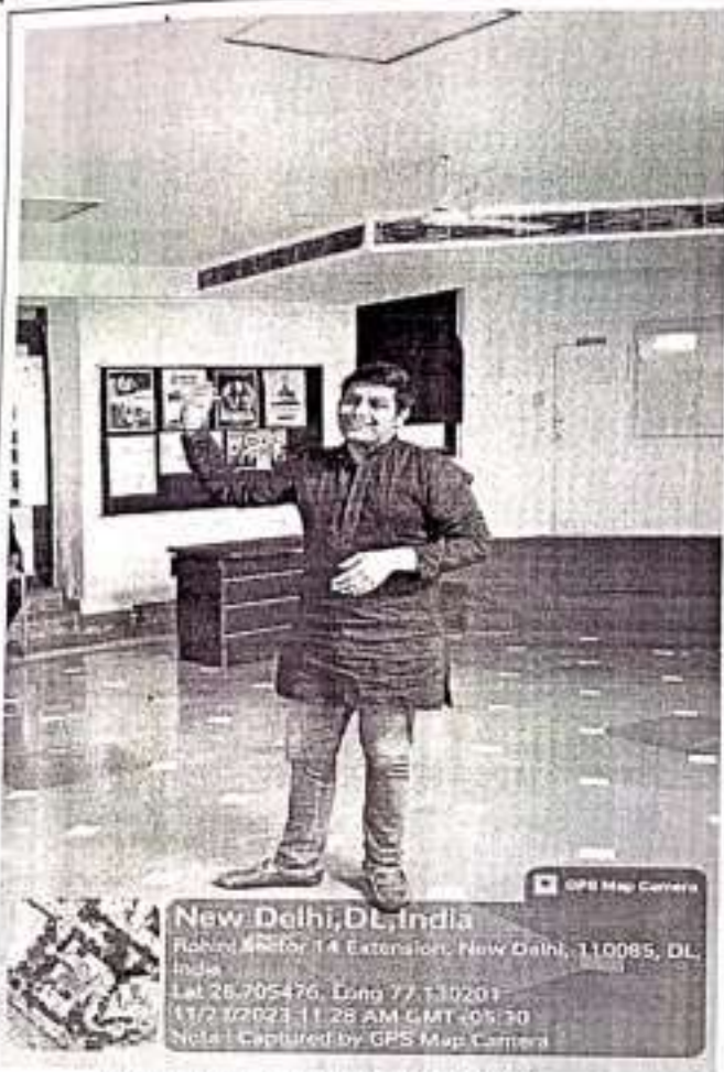
Student doing anchoring of the event.