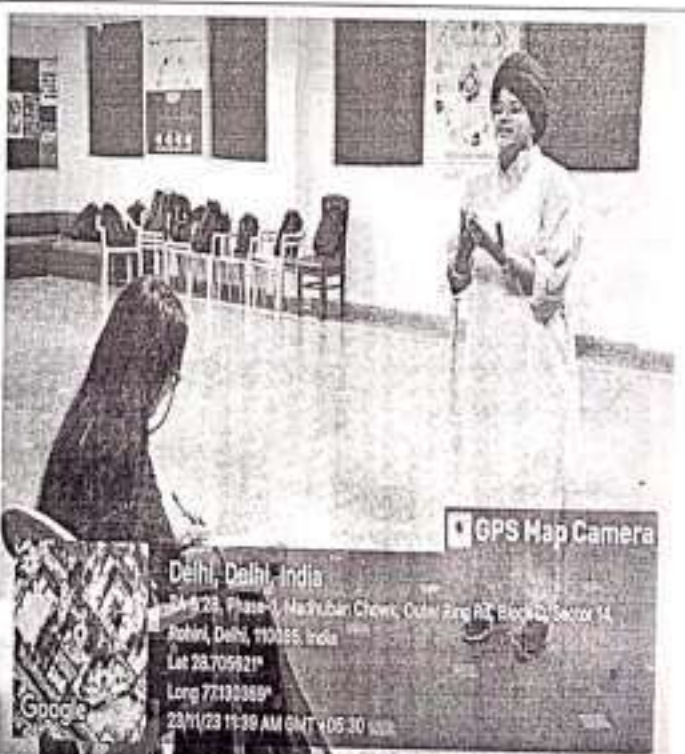
Student presenting Punjabi dress code by explaining the importance of turban.

Handwritten signature EBSH Club School of Excellence Sector 14, Rohini, Delhi - 85