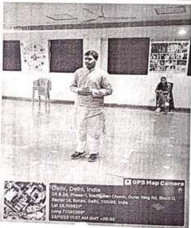
Student showcasing festive look of Delhi