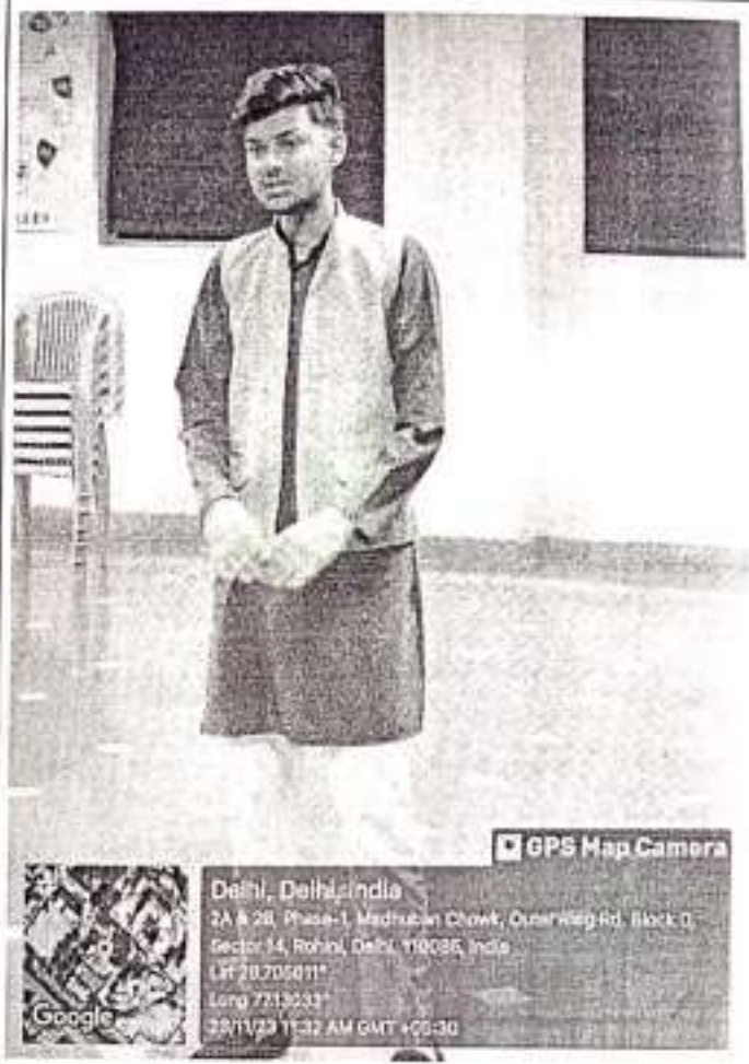
Student introducing Jodhpur's dressing style