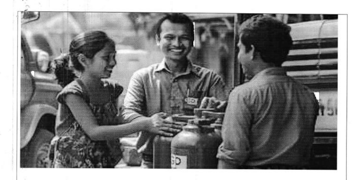
Safety First: Empowering Communities with Lifesaving LPG and Emergency Skills