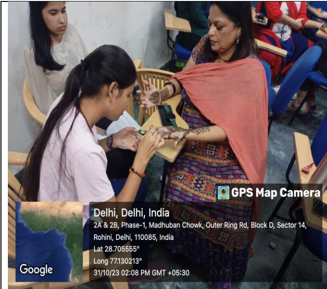
Student was applying Mehendi to faculties