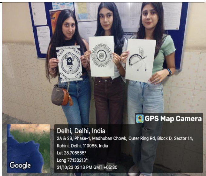
Demonstration of Mandala Art with Nodal Officer