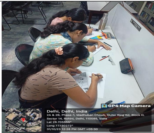
Students were creating Mandala Art