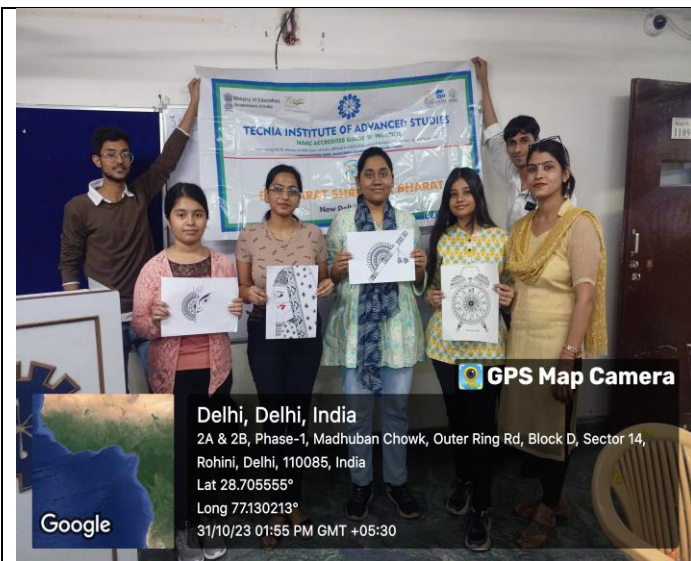
Demonstration of Mandala Art with Nodal Officer