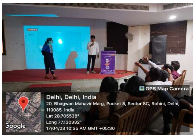
Students participating in the session