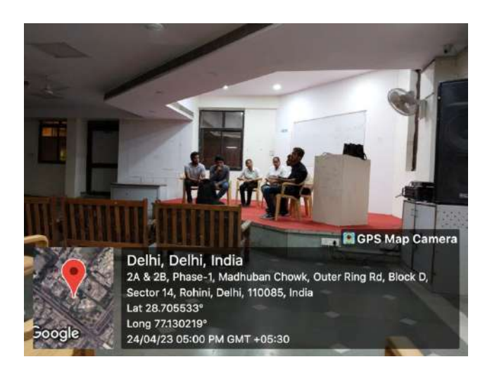
Students sharing their opinion