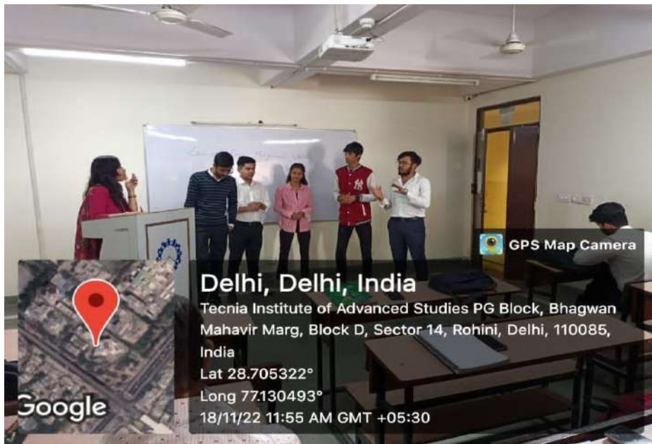
Students Participating in Group Discussion