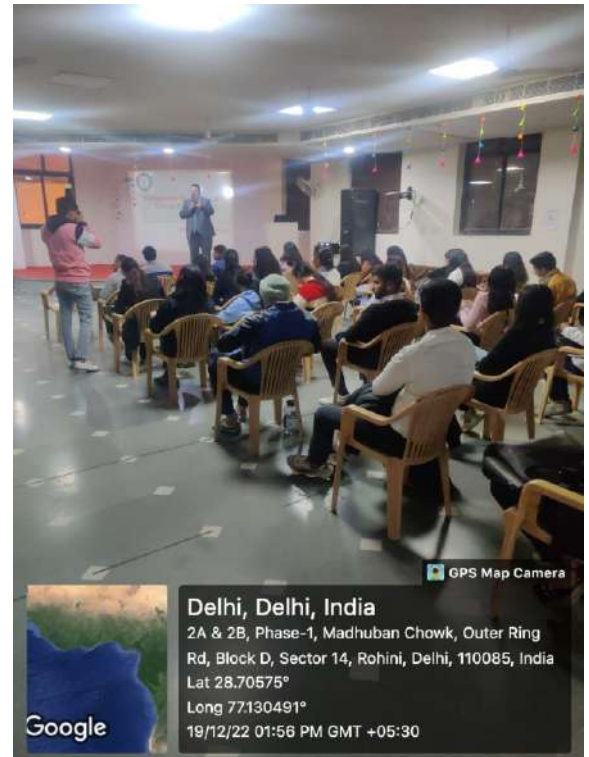
Students taking notes during the session