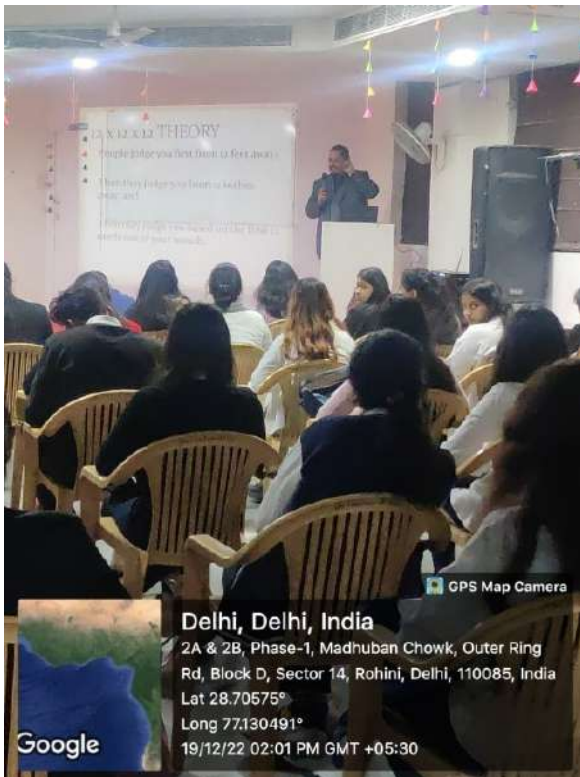
Resource person sharing the tips for personal grooming