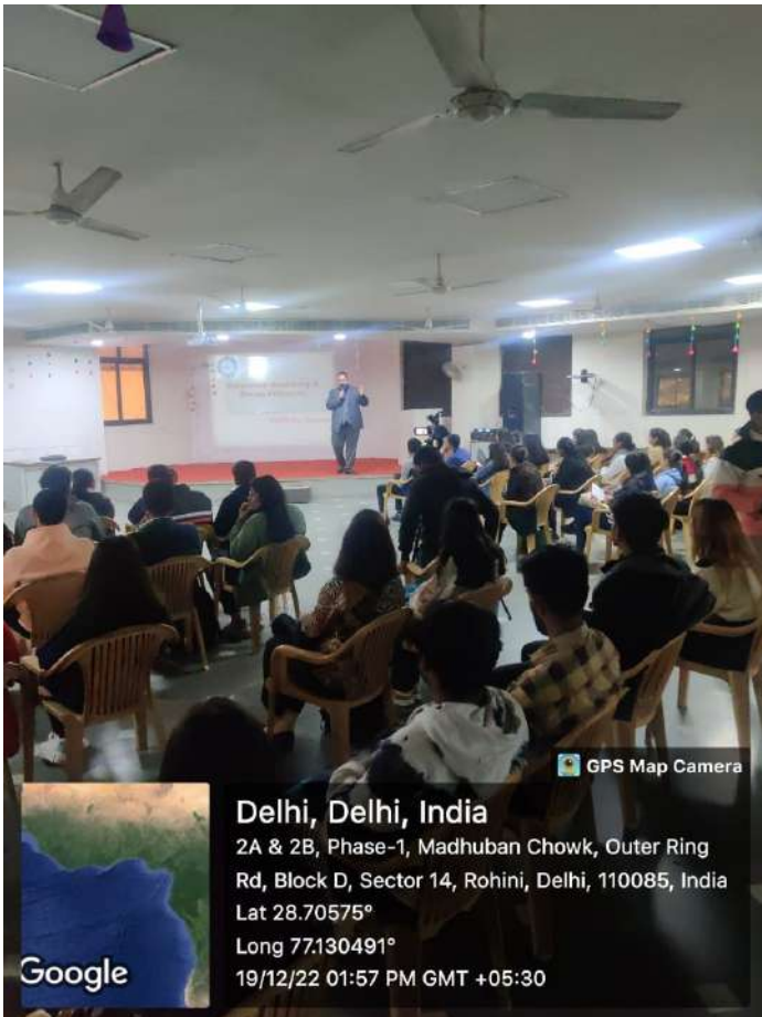
Resource person sharing the tips for personal grooming