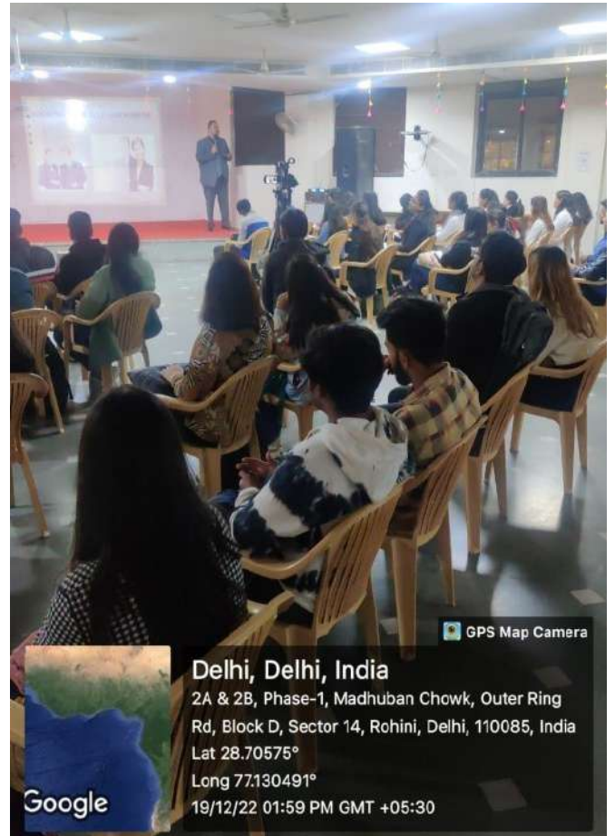
Students taking notes during the session