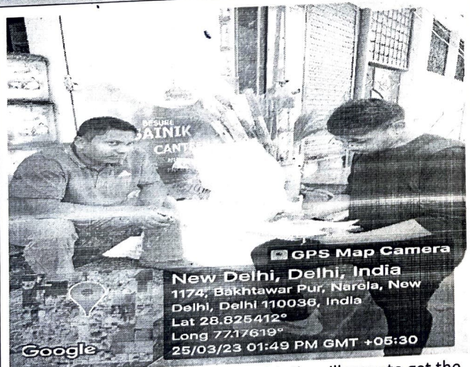
Image 1 – Students interacting with the villagers to get the information