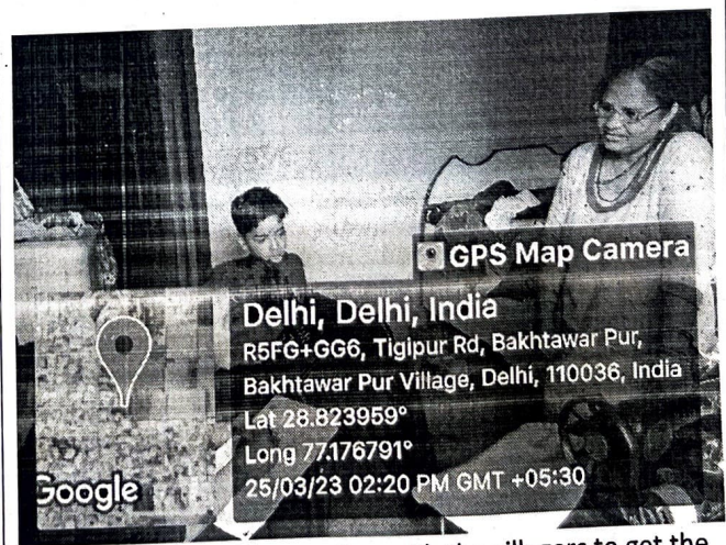
Image 2 – Students interacting with the villagers to get the information