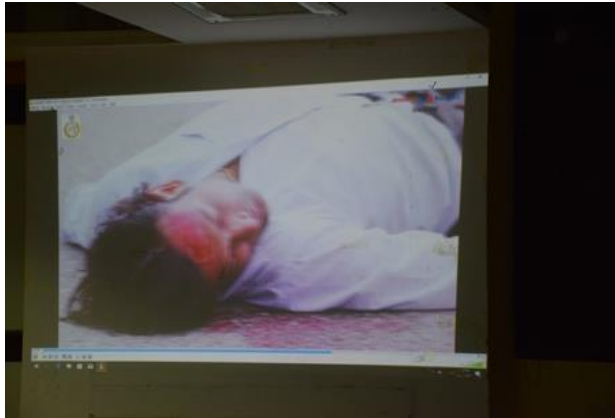
A person is hit by Drunken person who is driving a car shown to students in the movie of Road Safety in 29 th National Road Safety Week -2023.