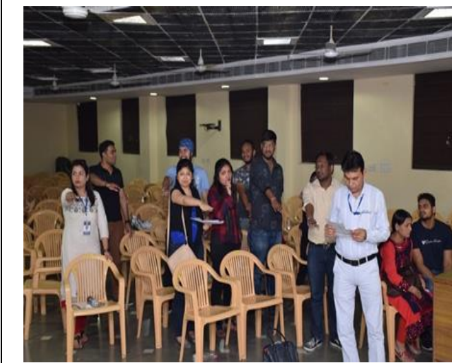
Staff members and students taking pledge in 29 th National Road Safety Week -2018 to follow traffic rules between 13 th - 17 th May, 2023.