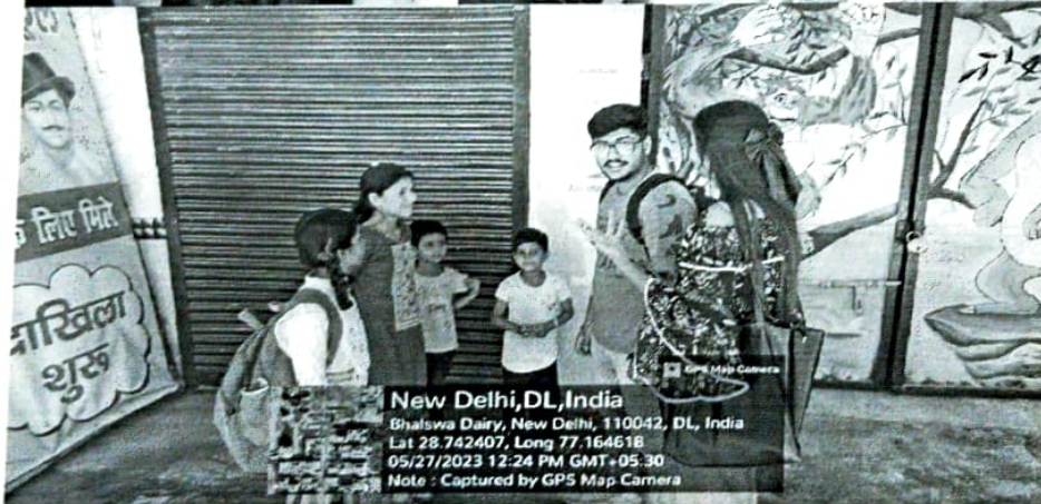
Students during campaign at Bhalaswa Dairy and Sakurbasti

In-Charge, Literary Club Vedika Institute of Advancement Madhuban Chowk, Rohini, Delhi-85