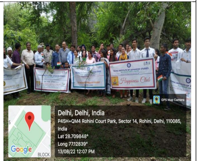
Plantation drive by various clubs of TIAS