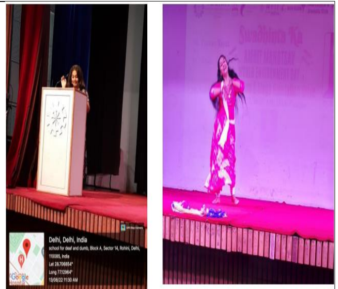
Speech and dance performance by TIAS Students