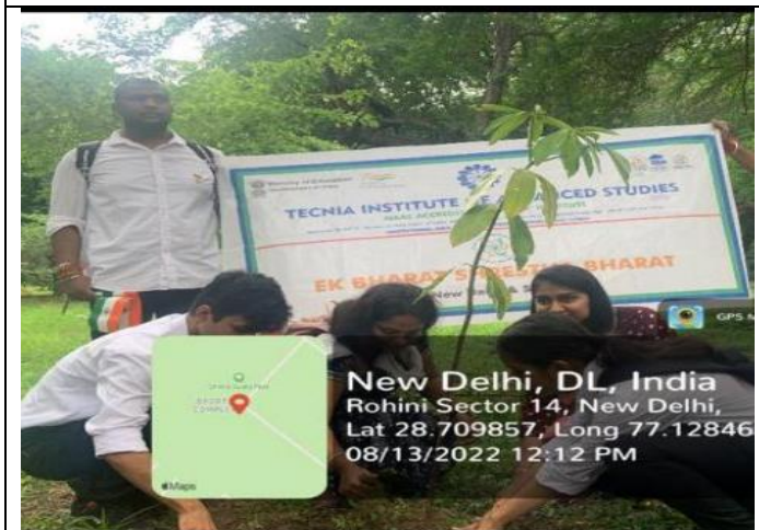
Plantation by EBSB clubs of TIAS