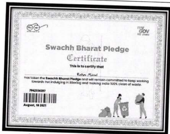
Certificate Given By MyGov

Photograph of the Event with the Caption