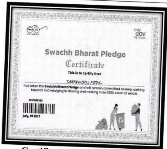
Certificate Given By MyGov