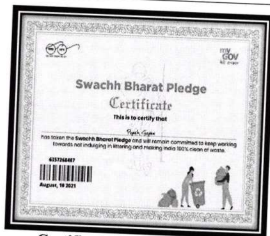
Certificate Given By MyGov