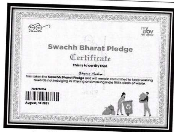
Certificate Given By MyGov

INTERNAL QUALITY ASSESSMENT CELL (IQAC) TECNIA INSTITUTE OF ADVANCED STUDIES NEW DELHI - 110085