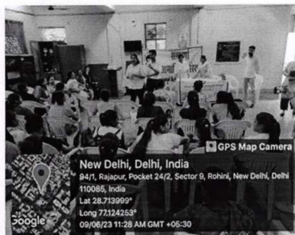
Explaining how to stable the Emotional Quotient

INTERNAL QUALITY ASSESSMENT CELL (IQAC) TECNIA INSTITUTE OF ADVANCED STUDIES NEW DELHI - 110085