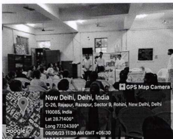
Spreading the Awareness About Happiness Within Yourself