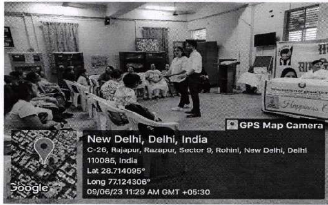
Awareness about Happy and Stable Life Style.