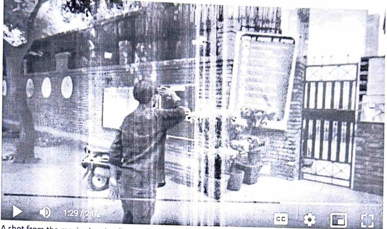
A shot from the movie showing "Respect from Indian Flag".