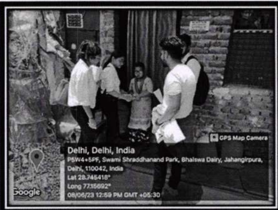
Distributing the Books and Stationary Kits to the Higher Secondary Level Students.

Report: Description in (min 250 to max 800 words)*