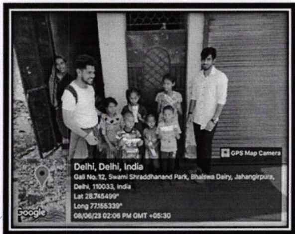
Distributing the Books and Stationery Kits to the Primary Level Students.