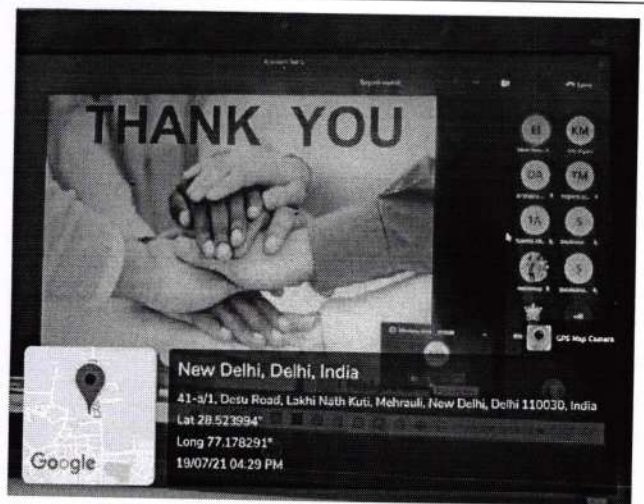
Vote of Thank given by Director Sir