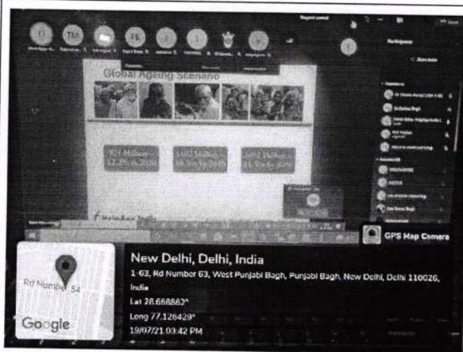
Discussion on Global Ageing Scenario