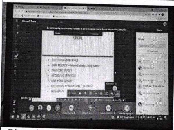
Discussion on Social Challenges faced by Elders