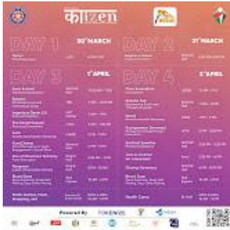
Kaizen Schedule.jpeg 181K

This communication, including any attachments, may not be free of viruses, interceptions or interference, and may not be compatible with your systems. You should carry out your own virus checks before opening any attachment to this e-mail. The sender of this e-mail and Institute shall not be liable for any damage that you may sustain as a result of viruses, incompleteness of this message, a delay in receipt of this message or computer problems experienced.