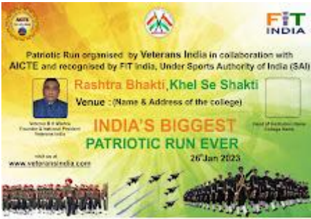
patriotic run banner.jpeg 303K