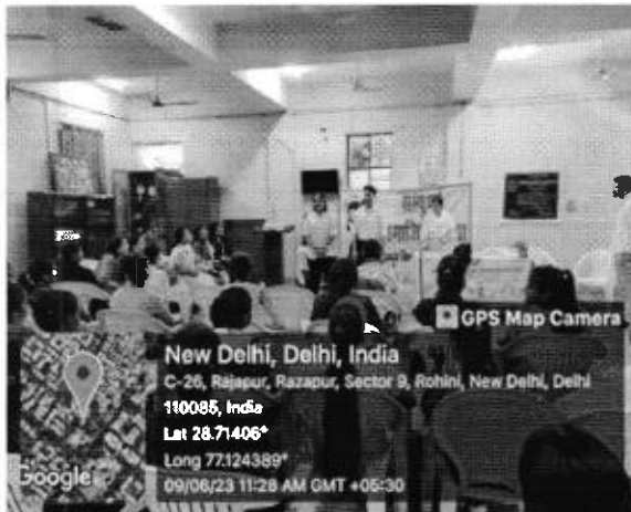
Spreading the Awareness About Happiness Within Yourself