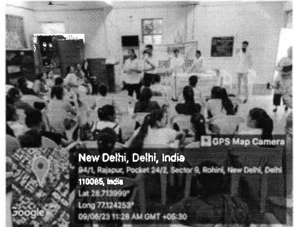
Explaining how to stable the Emotional Quotient