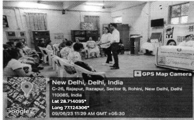
Awareness about Happy and Stable Life Style.

Report: Description in (min 250 to max 800 words)*