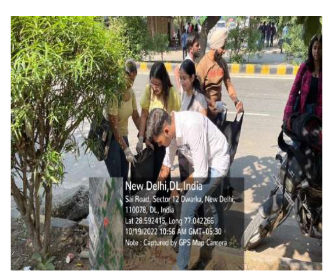
NSS Volunteers are collecting garbage from road

Programme Officer, NSS (SFU) Tecnia Institute of Advanced Studies Madhuban Chowk, Rohini, Delhi -85