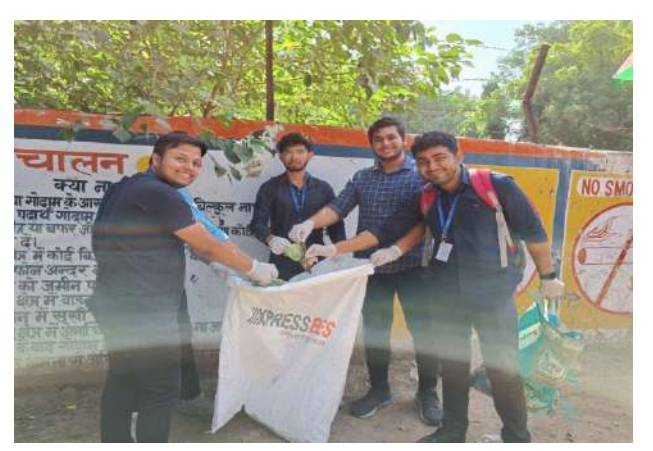
NSS Volunteers are collecting garbage from road