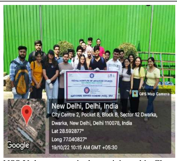
NSS Volunteers actively participated in Clean India Drive