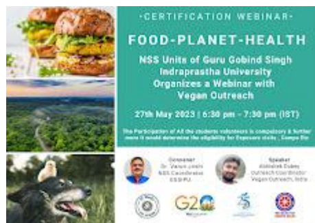
Vegan Outreach programme poster.jpeg 395K

This communication, including any attachments, may not be free of viruses, interceptions or interference, and may not be compatible with your systems. You should carry out your own virus checks before opening any attachment to this e-mail. The sender of this e-mail and Institute shall not be liable for any damage that you may sustain as a result of viruses, incompleteness of this message, a delay in receipt of this message or computer problems experienced.