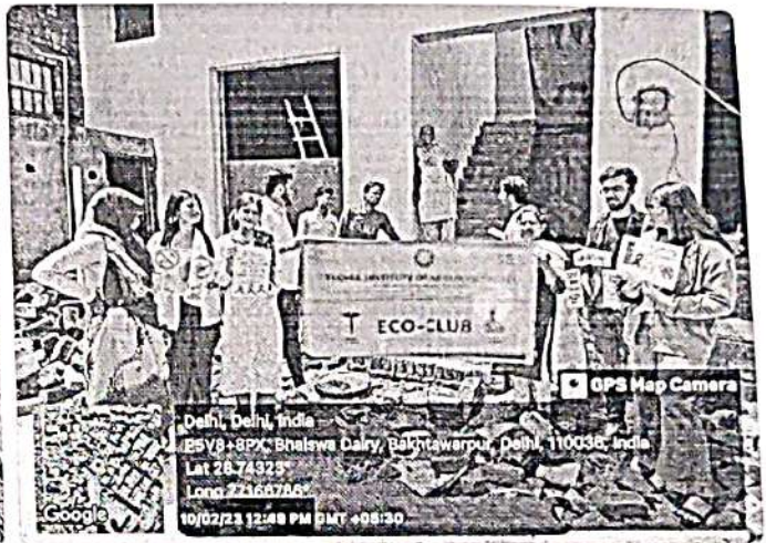
Students creating awareness among people at Bhalswa Dairy