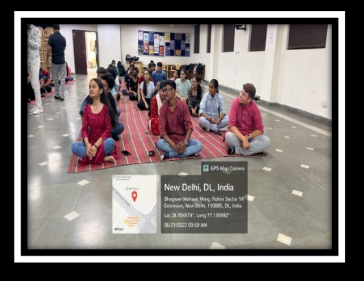
Students performing yoga