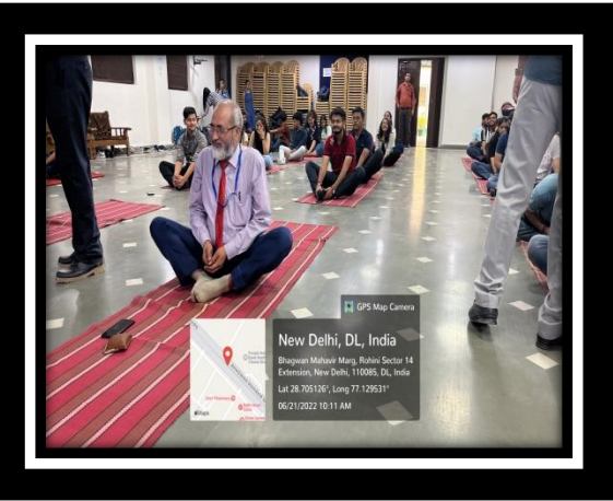
Faculty performing yoga with instructors