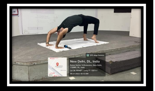
Student and Guest yoga pose