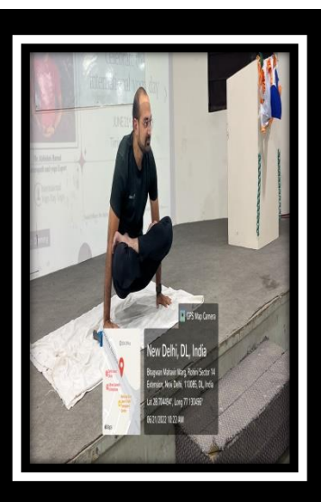
Guest performing yoga asana