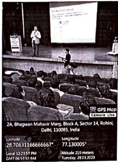
Resource person brief about the workshop

Photograph of the Event with the Caption