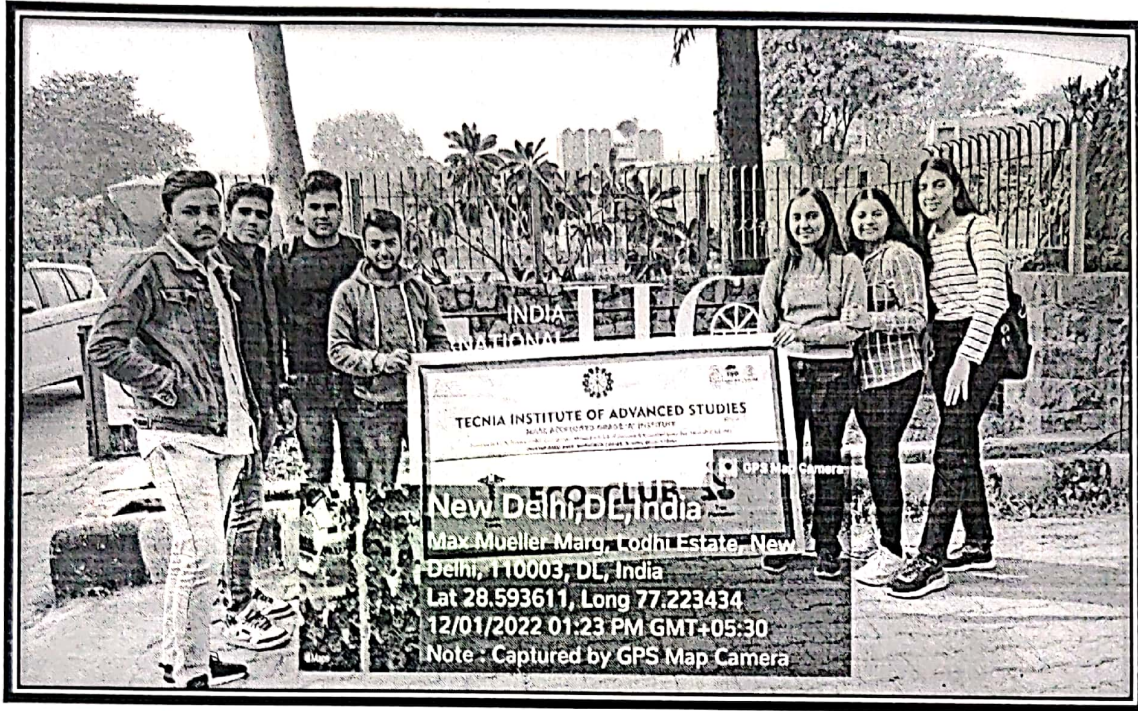
A Group of students, Volunteers from various programs have participated in it