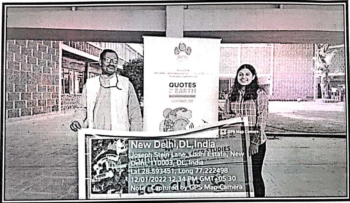
A Group of students, Volunteers from various programs have participated in it