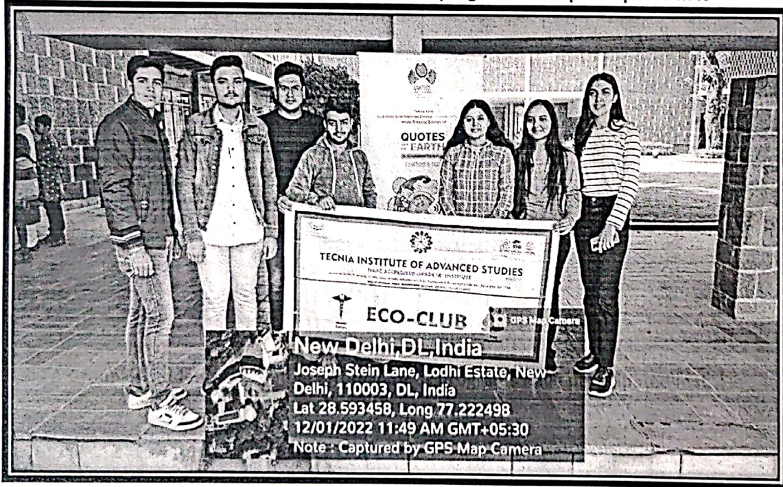
A Group of students, Volunteers from various programs have participated in it