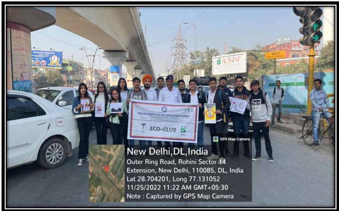
Students Participate in "Awareness Drive on Air Pollution"