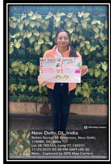
Students Participate in “Awareness Drive on Air Pollution”

Report: Description in (min 250 to max 800 words)*