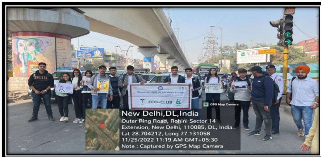
Students Participate in “Awareness Drive on Air Pollution”