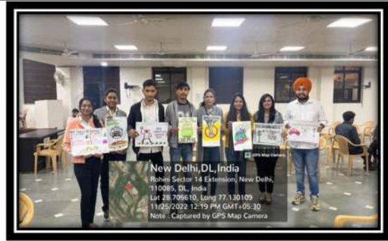
Students Participate in “Awareness Drive on Air Pollution”