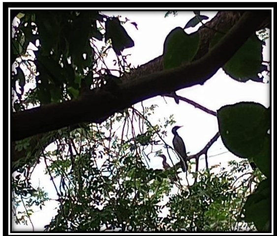
Students Participate in Awareness Drive at "Okhla Bird Santuray "