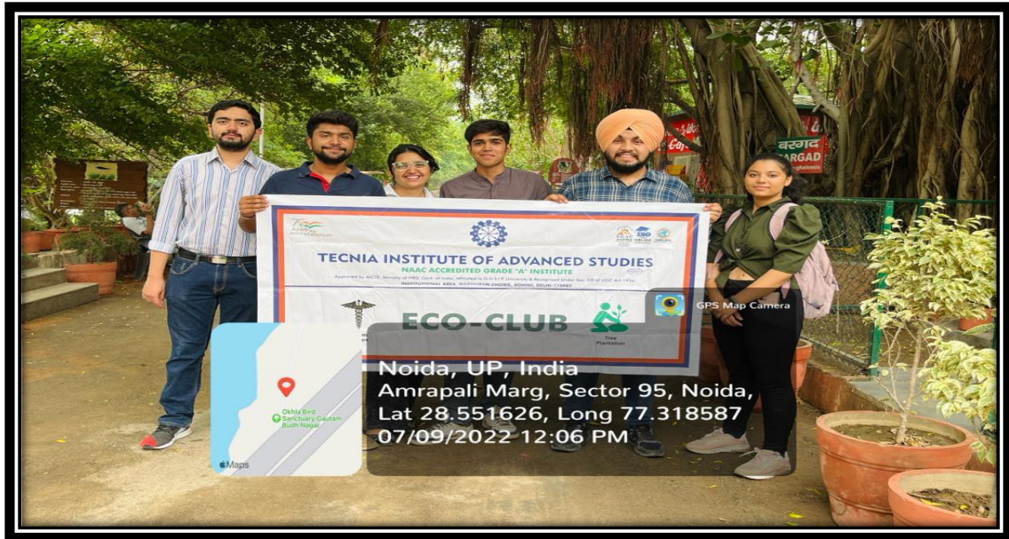
Students Participate in Awareness Drive on “Okhla Bird Santuray “