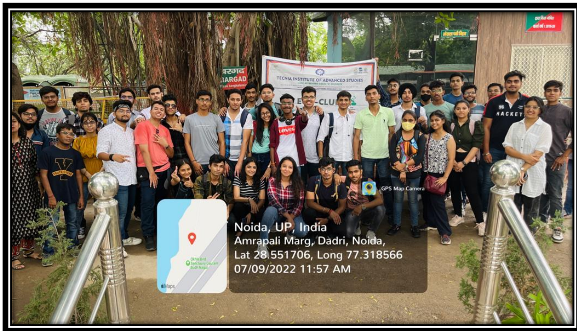
Students Participate in Awareness Drive at “Okhla Bird Santuray “