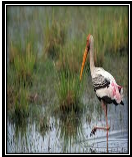
Students Participate in Awareness Drive at "Okhla Bird Santuray "