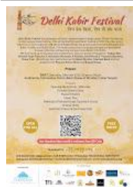
DKF POSTER_Day1-01.jpg 3532K

This communication, including any attachments, may not be free of viruses, interceptions or interference, and may not be compatible with your systems. You should carry out your own virus checks before opening any attachment to this e-mail. The sender of this e-mail and Institute shall not be liable for any damage that you may sustain as a result of viruses, incompleteness of this message, a delay in receipt of this message or computer problems experienced.