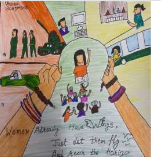
Posters made by Students

Learning Outcome: The participants have demonstrated the role and contribution of women in society in various dimensions through posters.