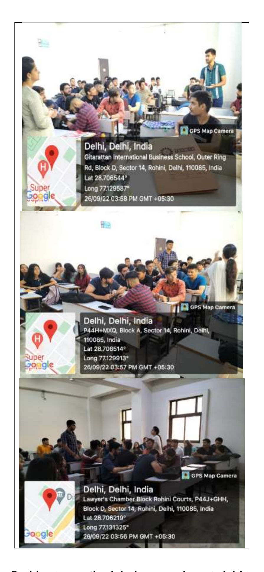
Participants presenting their views on gender neutral rights