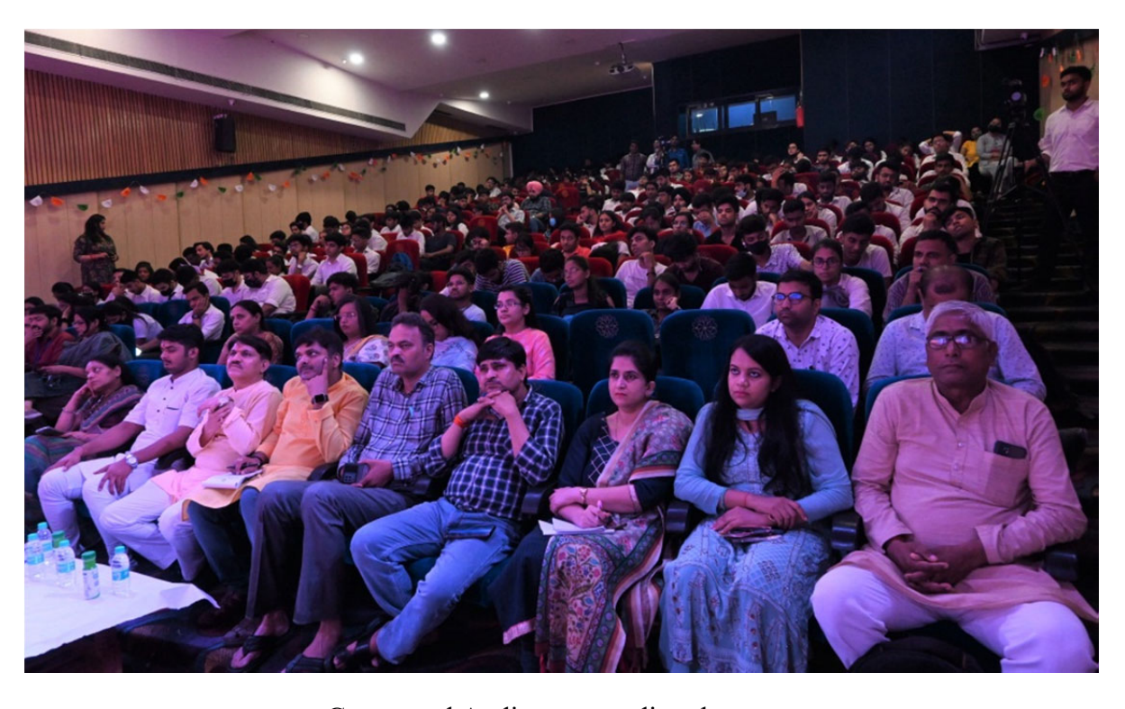
Guests and Audience attending the event