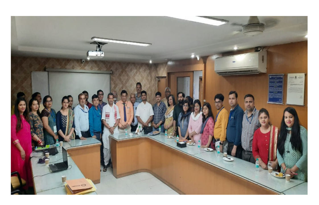
Group photograph of the guests with faculties of TIAS

Learning Outcome: The participants have learnt about the role and importance of a Guru in Scholar's life.