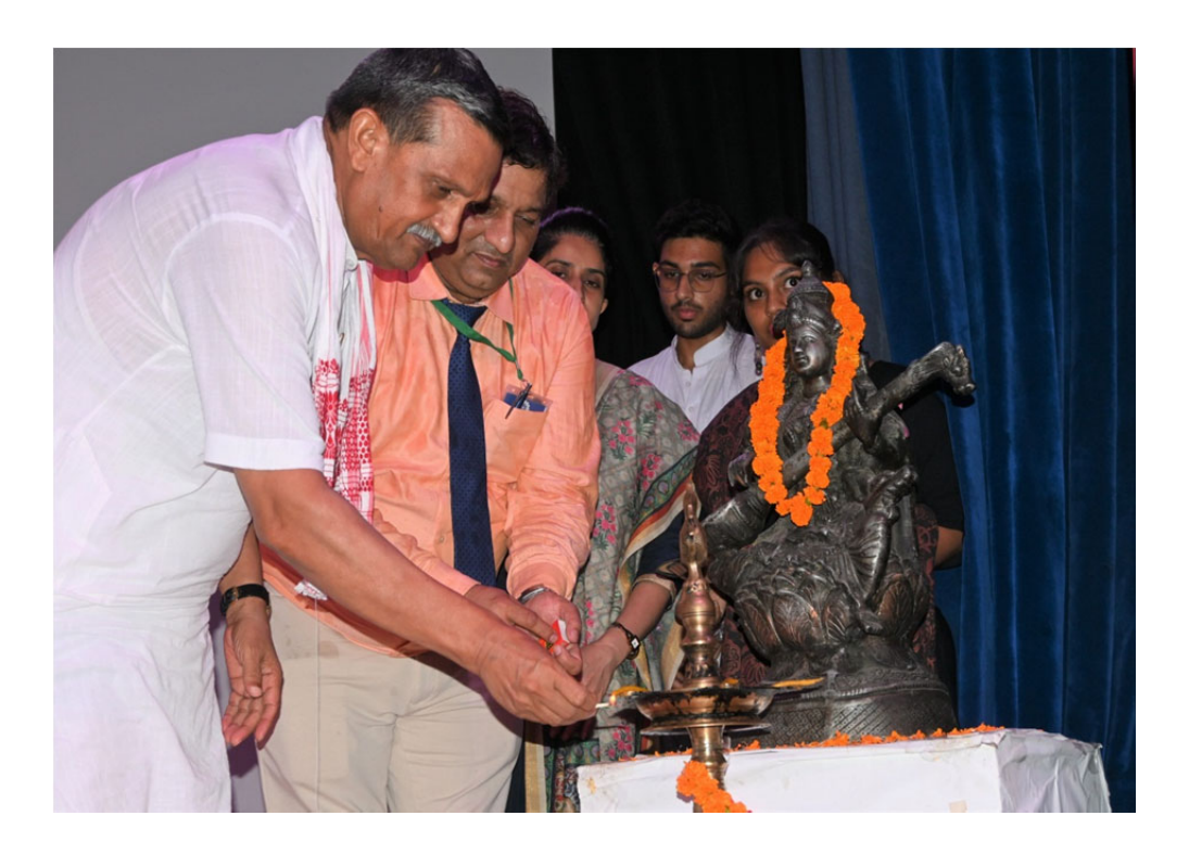
Lightning of the Lamp