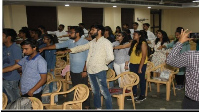
Students taking oath for “World No Tobacco Day”