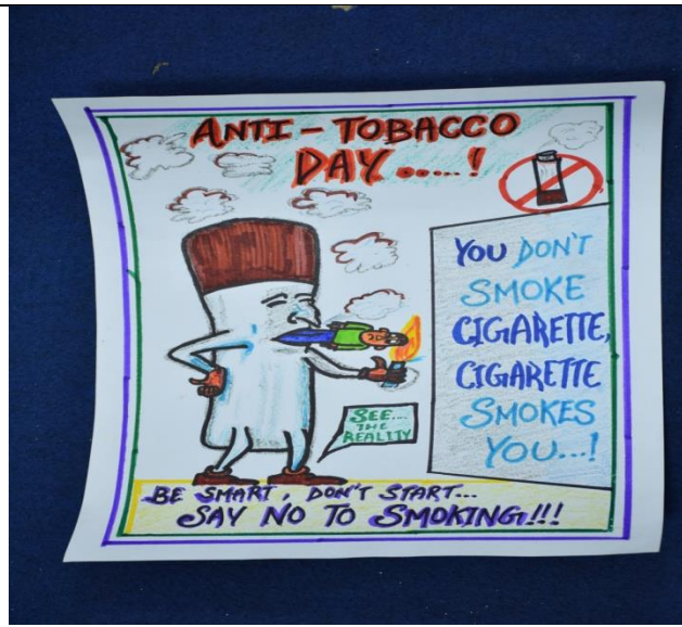
Students Poster for “World No Tobacco Day” showing Smoking is injurious for health.