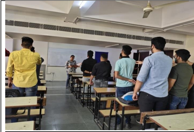
Students and Faculties taking oath for “ World No Tobacco Day ”