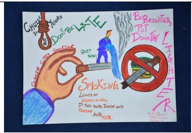
Poster showing side effects of Smoking Intake for Health in “ World No Tobacco Day ”