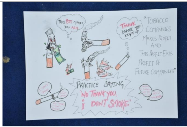
Poster showing side effects of Tobacco Intake for Health in “ World No Tobacco Day ”