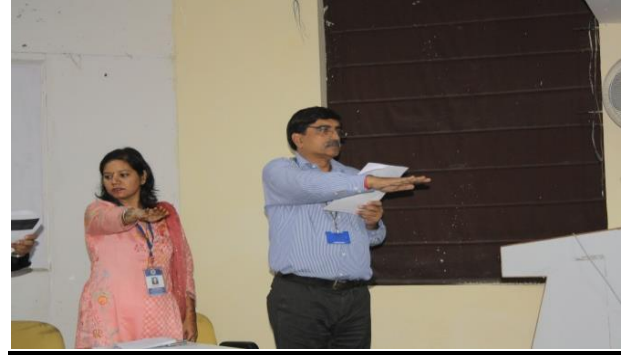
Faculties taking oath for “World No Tobacco Day”