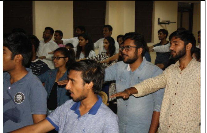
Students taking oath for “ World No Tobacco Day ”