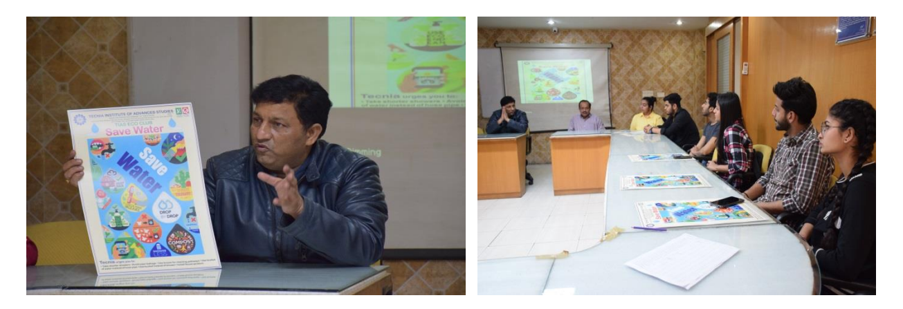
Director, TIAS discussing with students regarding importance of saving water

Save water is the water conservation for solving the problems of water scarcity in the future. In many regions of the India and other countries there is much shortage of water and people have to go for long distance to get drinking and cooking water to fulfill daily routine. On the other hand, people are wasting more water than their daily need in the regions of sufficient water. We need to understand the importance of water and problems related to lack of water in the future. We should not waste and contaminate useful water in our life and promote water saving and conservation among people. To fight with these problems and spreading awareness about the same, Tecnia spearheads the campaign on "Save Water" through posters involving the students of TECNIA Institute of advanced studies, on 5<sup>th</sup> June 2019 at 11 am in Institute campus to make people aware to save water. The Eco Club members along with students, TIAS visited to Director Office, library, IQAC, MBA, BBA, BJMC and MCA departments to sensitize the measures to save water.