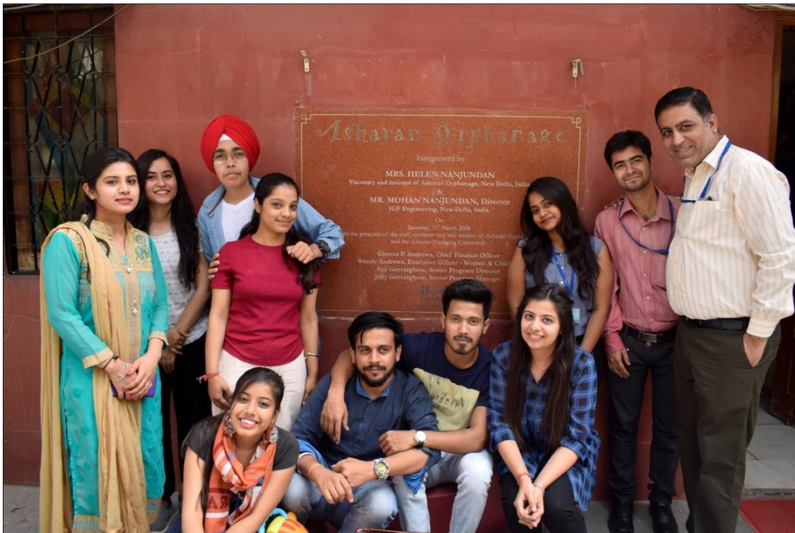
Students & TIAS Faculty Coordinators outside Orphanage Premises