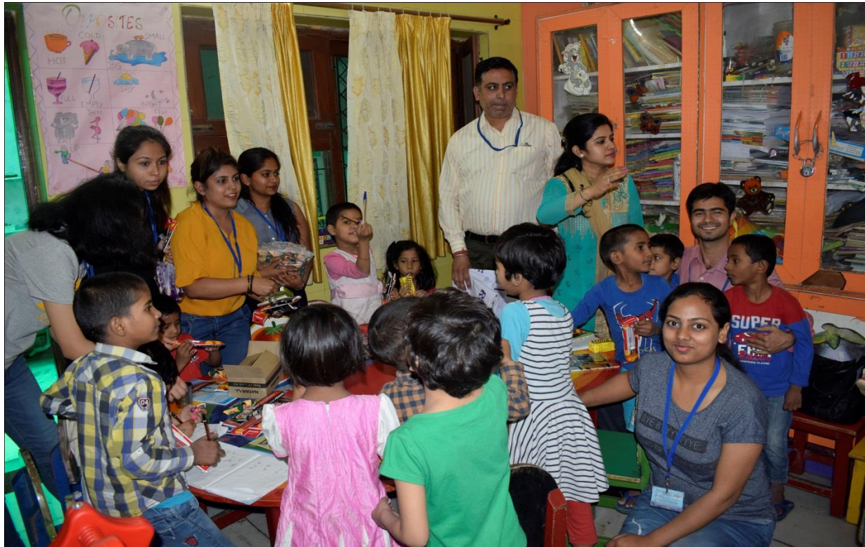
Students contributing and interacting with Orphan Children