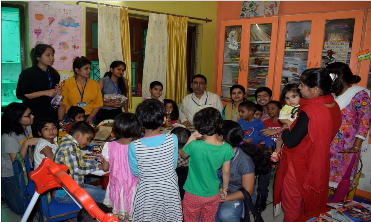
Students contributing and interacting with Orphan Children