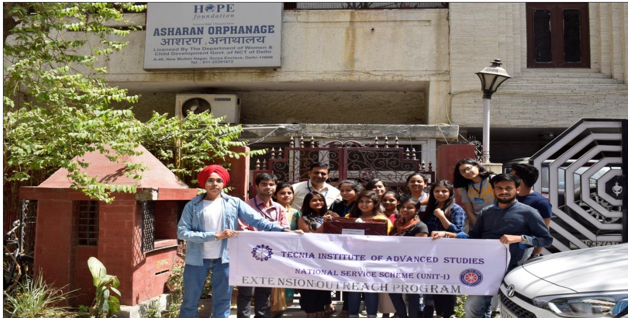
Students & TIAS Faculty Coordinators outside Orphanage Premises