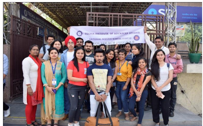
Students Gathering for the Visit to Orphanage