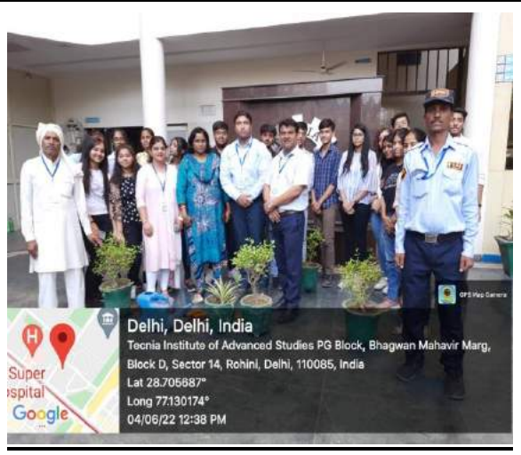
Plantation by TIAS Faculty & Students