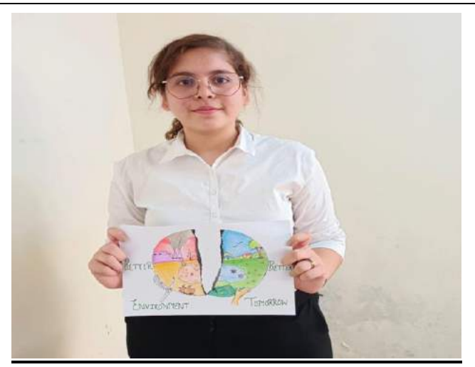
Poster by NSS Volunteer