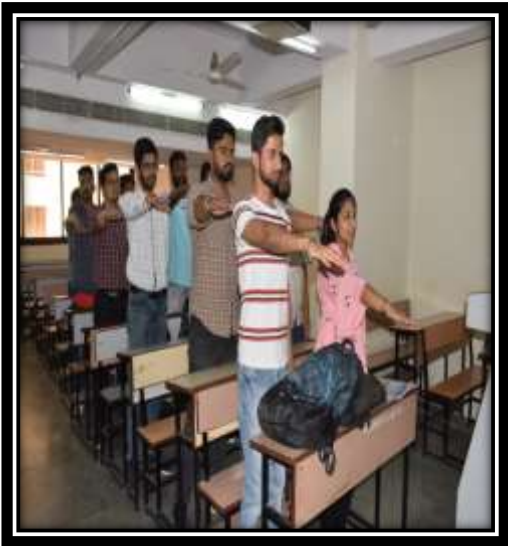
Students Participate in Pledge on “Water Day”