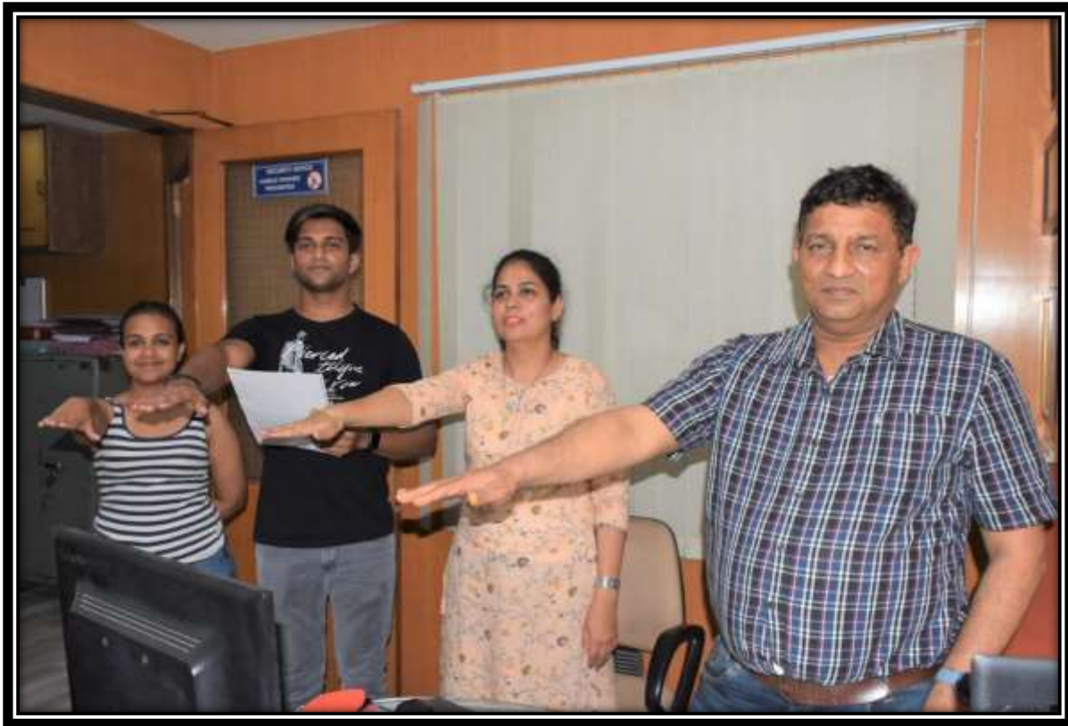
Director, Tias Participate in Pledge on “Water Day “