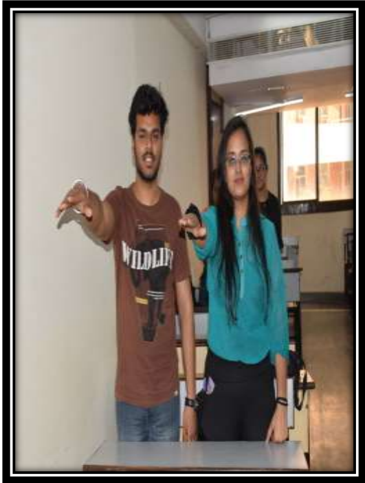
Students Participate in Pledge on “Water Day”