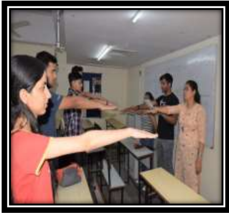
Students Participate in Pledge on "Water Day"