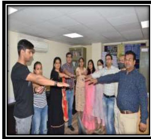
Students Participate in Pledge on "Water Day"