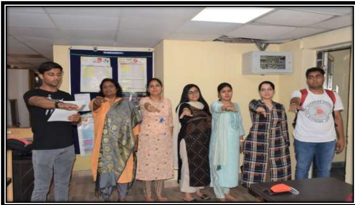
Faculty Members Participate in Pledge on "Water Day "