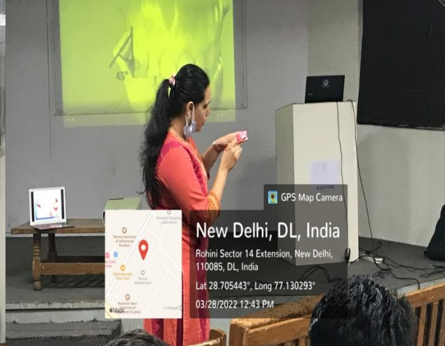
Students & Faculty Participation in the event