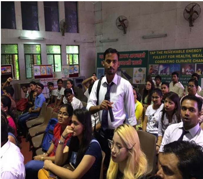
(Tias Eco Club Students Participating in Quiz Competition)