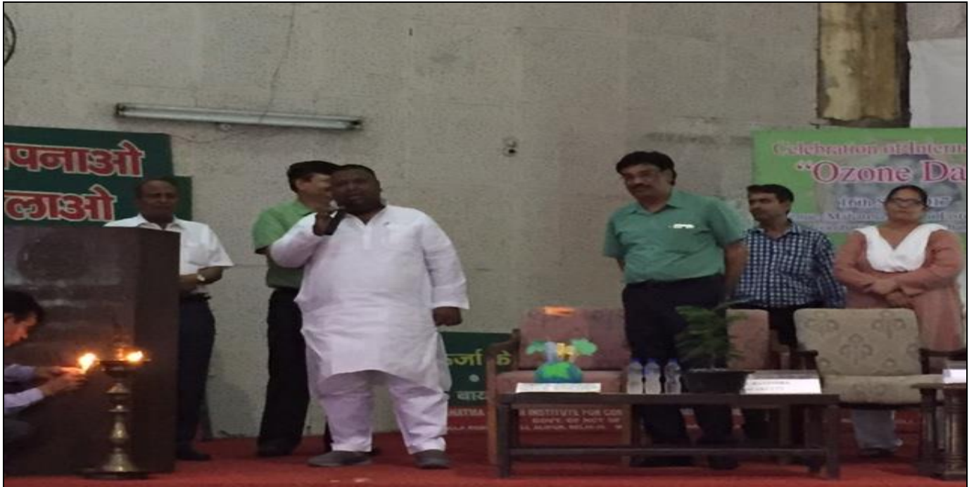
(Chief Guest Sh.Imran Hussain, Honorable Minister (Environment & Forest) addressing the gathering)