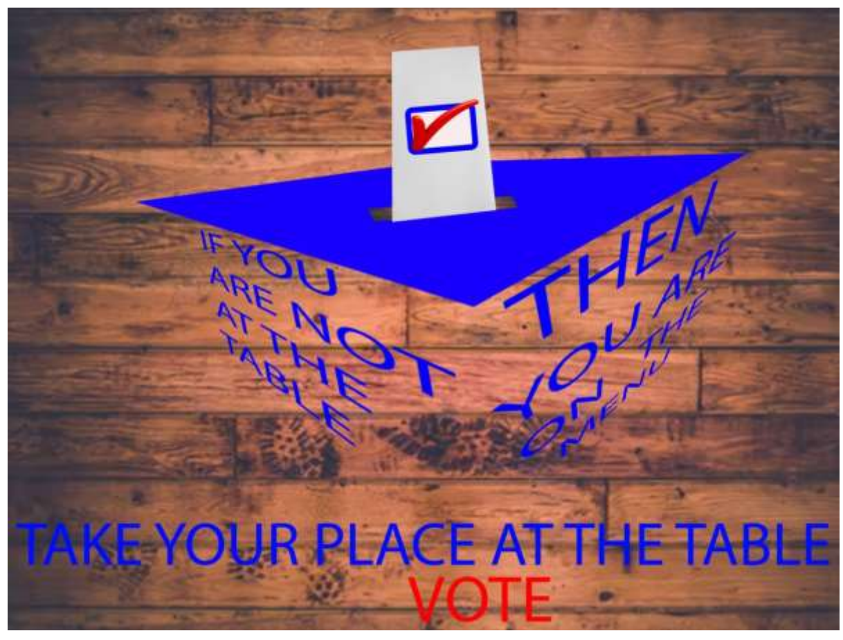
Tushar 4 Sem - Poster