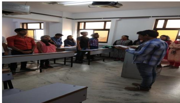
Students of Tecnia Institute of Advanced Studies, New Delhi giving tribute to Nation Father on his Martyrdom Day 29th January, 2022