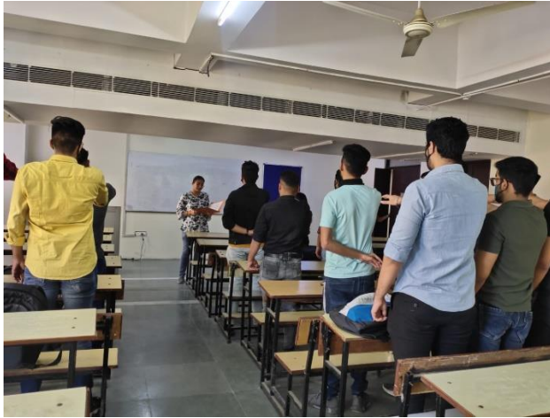
Students and Faculty members giving tribute to Nation Father on his Martyrdom Day on 29th January, 2022