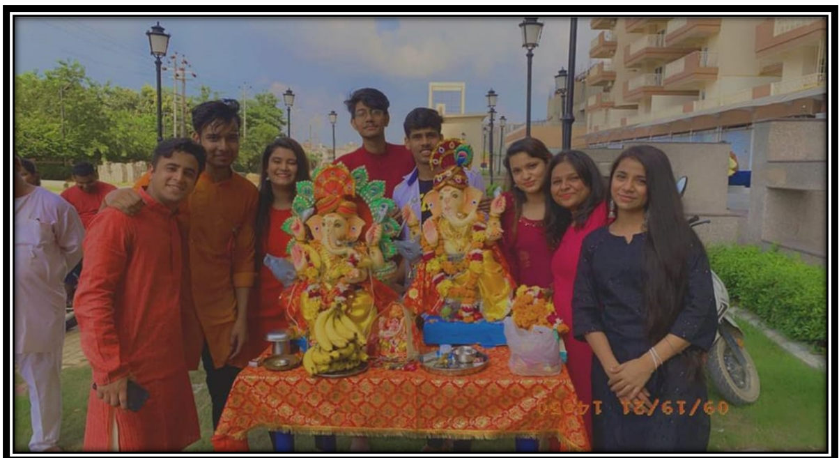
Students Participation in Celebration of Genesh Chaurthi