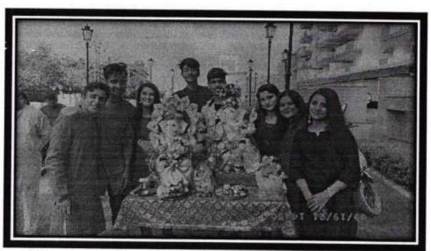
Students Participation in Celebration of Ganesh Chaturthi