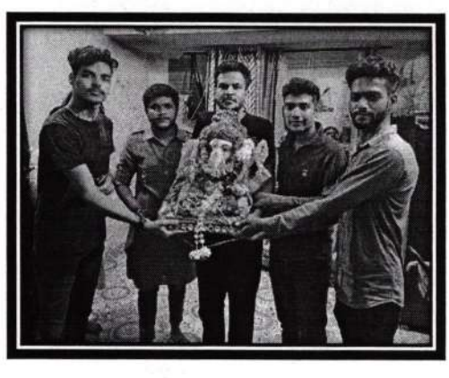
Students Participation in Celebration of Ganes Chaturthi

Report: Description in (min 250 to max 800