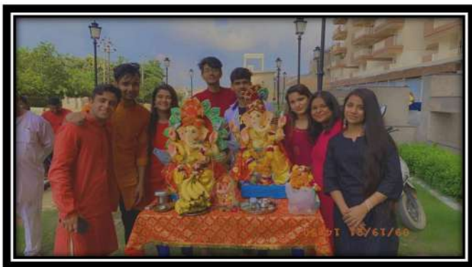
Students Participation in Celebration of Ganesh Chaturthi