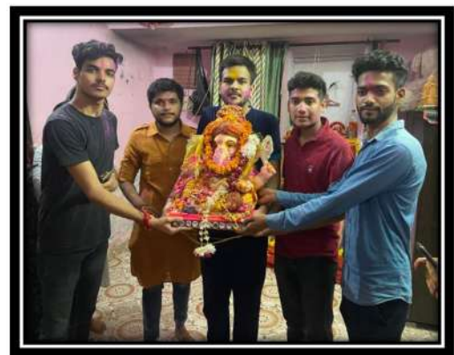
Students Participation in Celebration of Ganesh Chaturthi