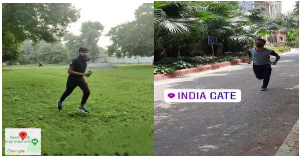
Students Participation in the Fit India Freedom Run 2.0