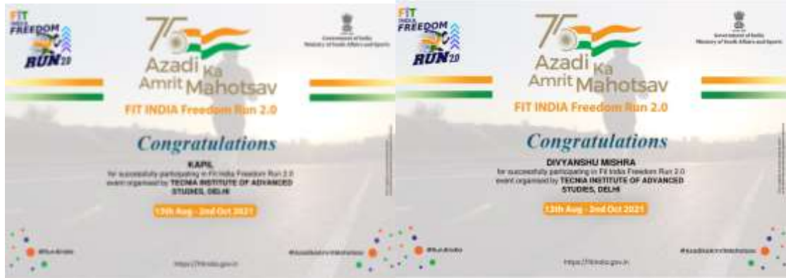
Students Participation Certificated generated from Fitindia.gov.in