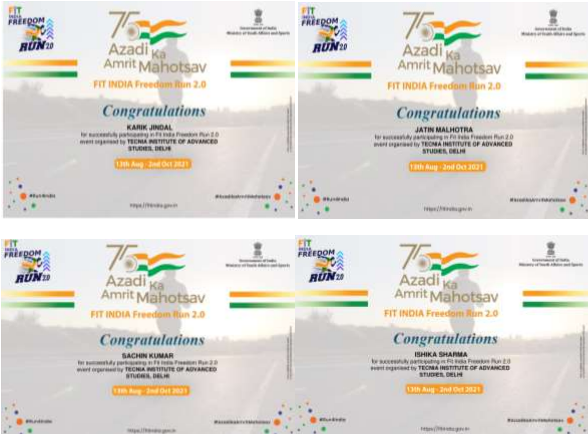
Students Participation Certificated generated from Fitindia.gov.in