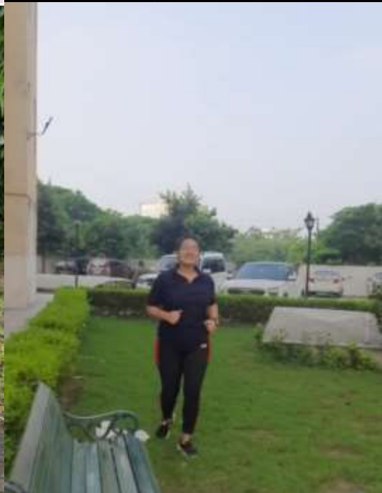
Students Participation in the Fit India Freedom Run 2.0