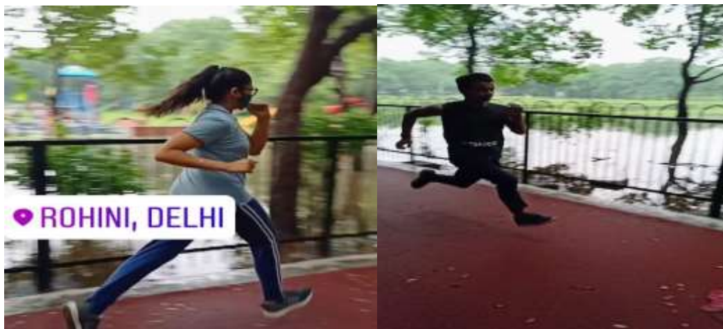
Students Participation in the Fit India Freedom Run 2.0