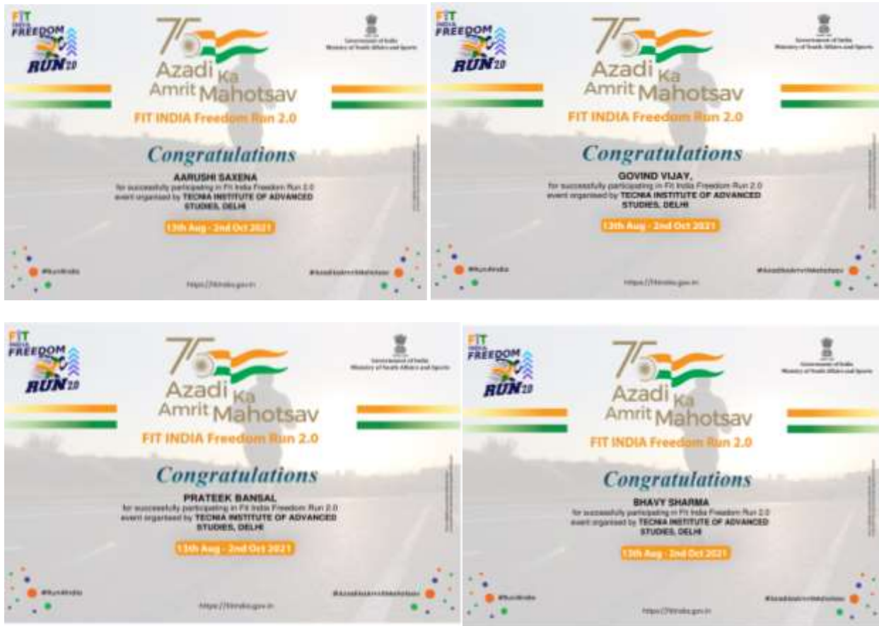
Students Participation Certificated generated from Fitindia.gov.in

4. Share their photos and videos to be uploaded on fitindia.gov.in