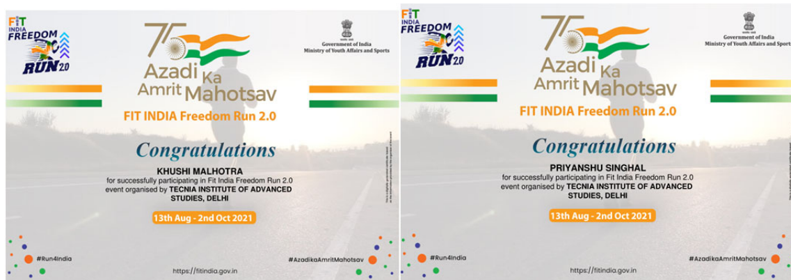
Students Participation Certificated generated from Fitindia.gov.in