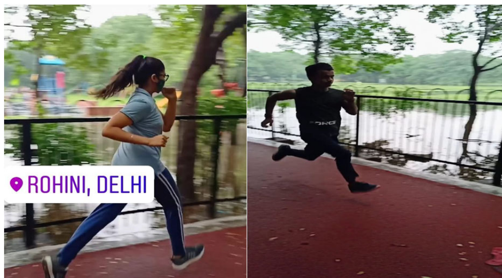
Students Participation in the Fit India Freedom Run 2.0